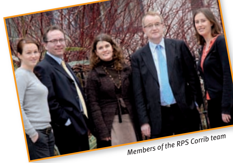
Members of the RPS Corrib team

For further information visit www.rpsgroup.ie