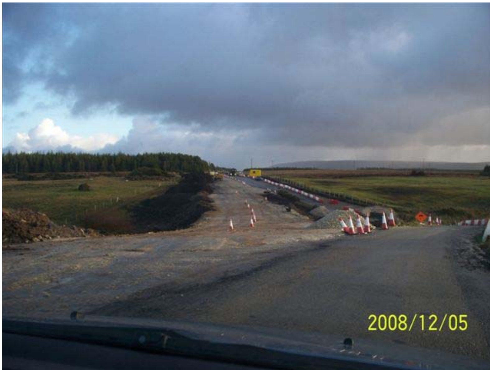
Road improvement works on the L1202