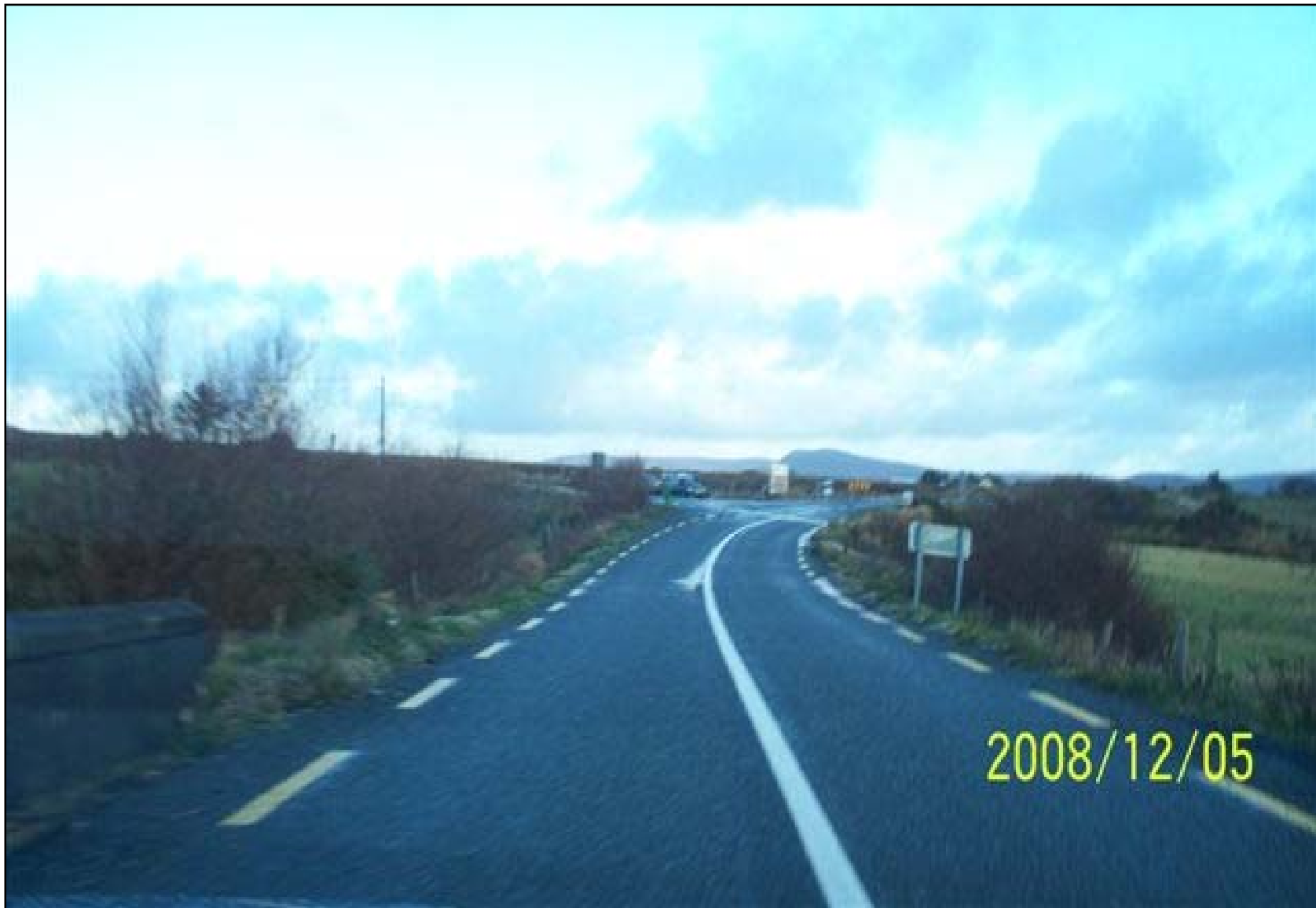
Regional Road R314 – Belmullet to Glenamoy - junction with L1203 to Ceathru Thaidhg/Rosspport