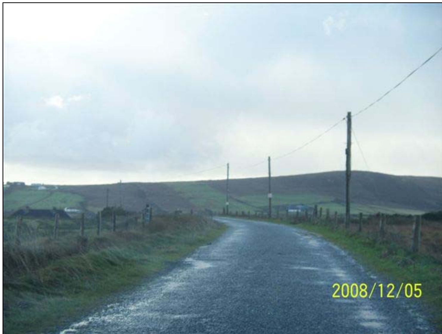
Local Road L52453-0