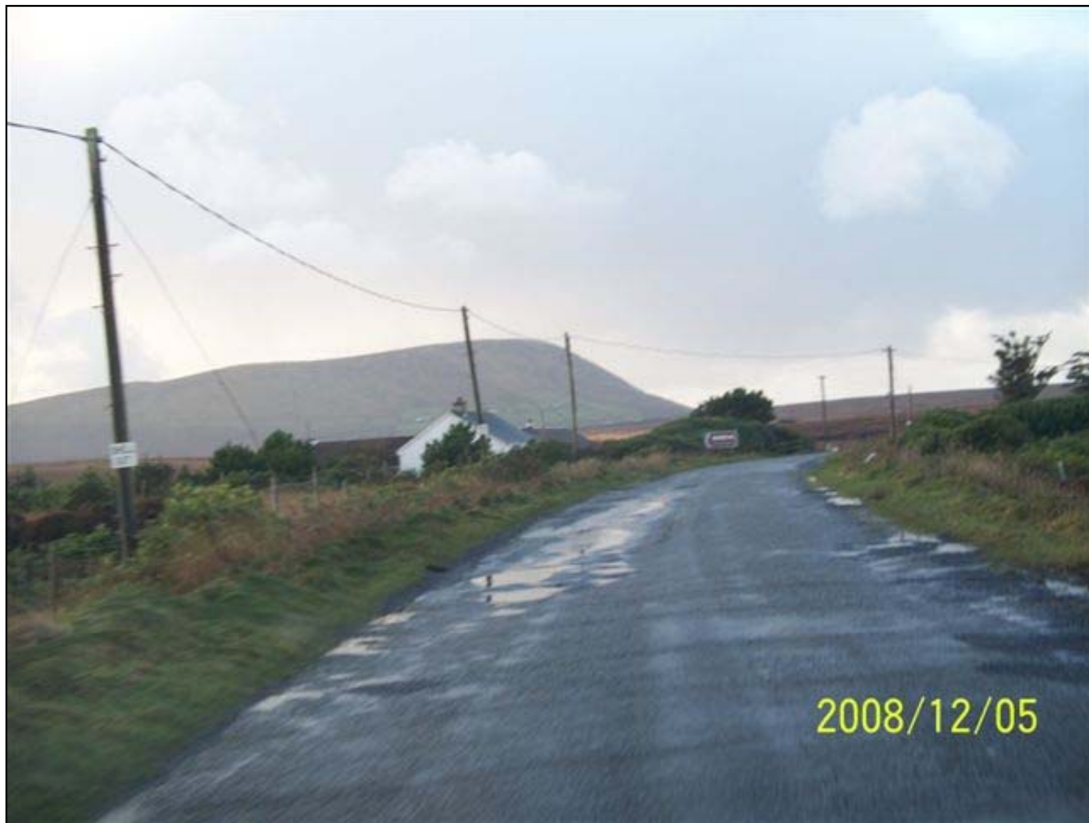
Local Road L52453-0 Barrthamh Road