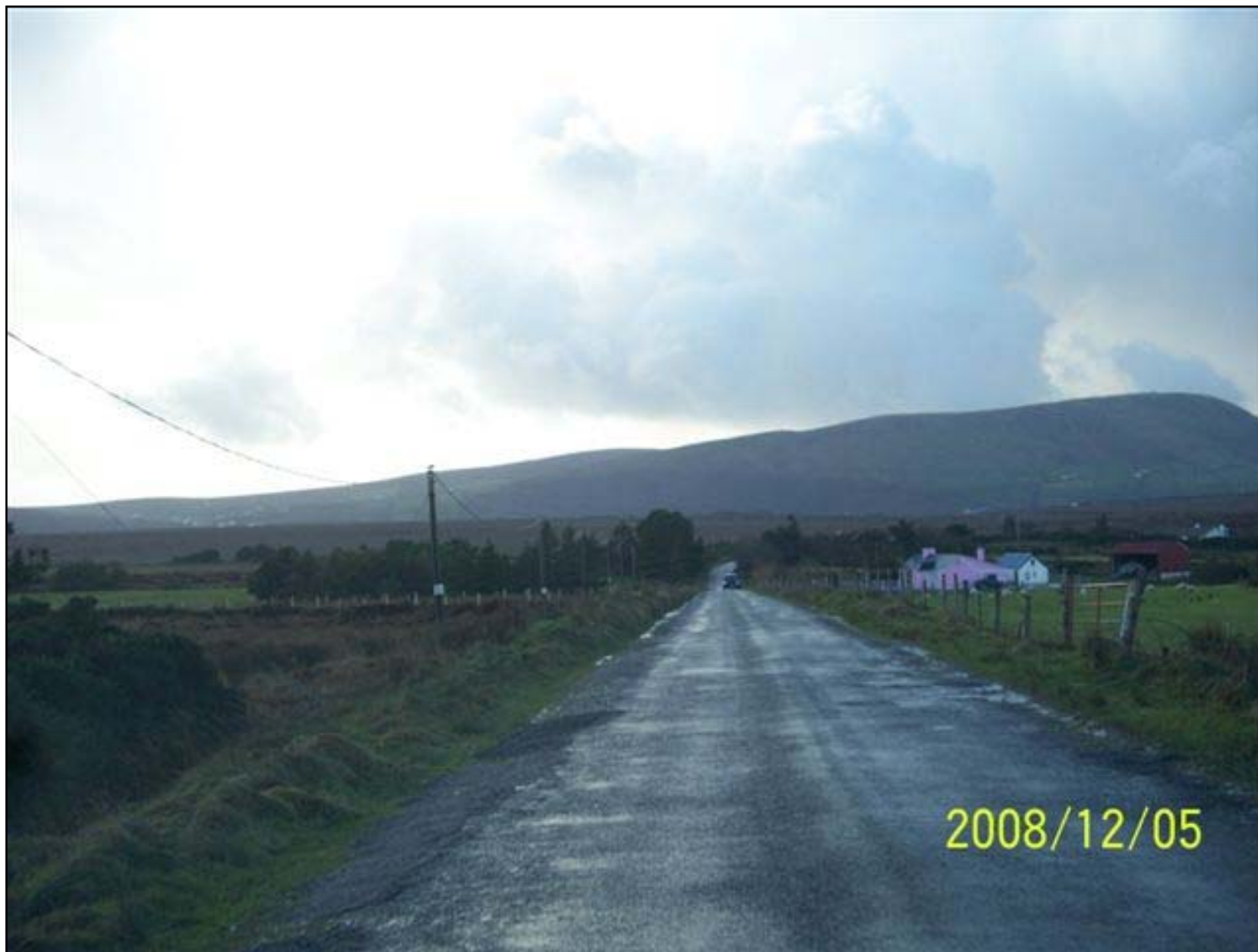
Potential Access Routes during Construction : L5245-0 Barrthamh Road