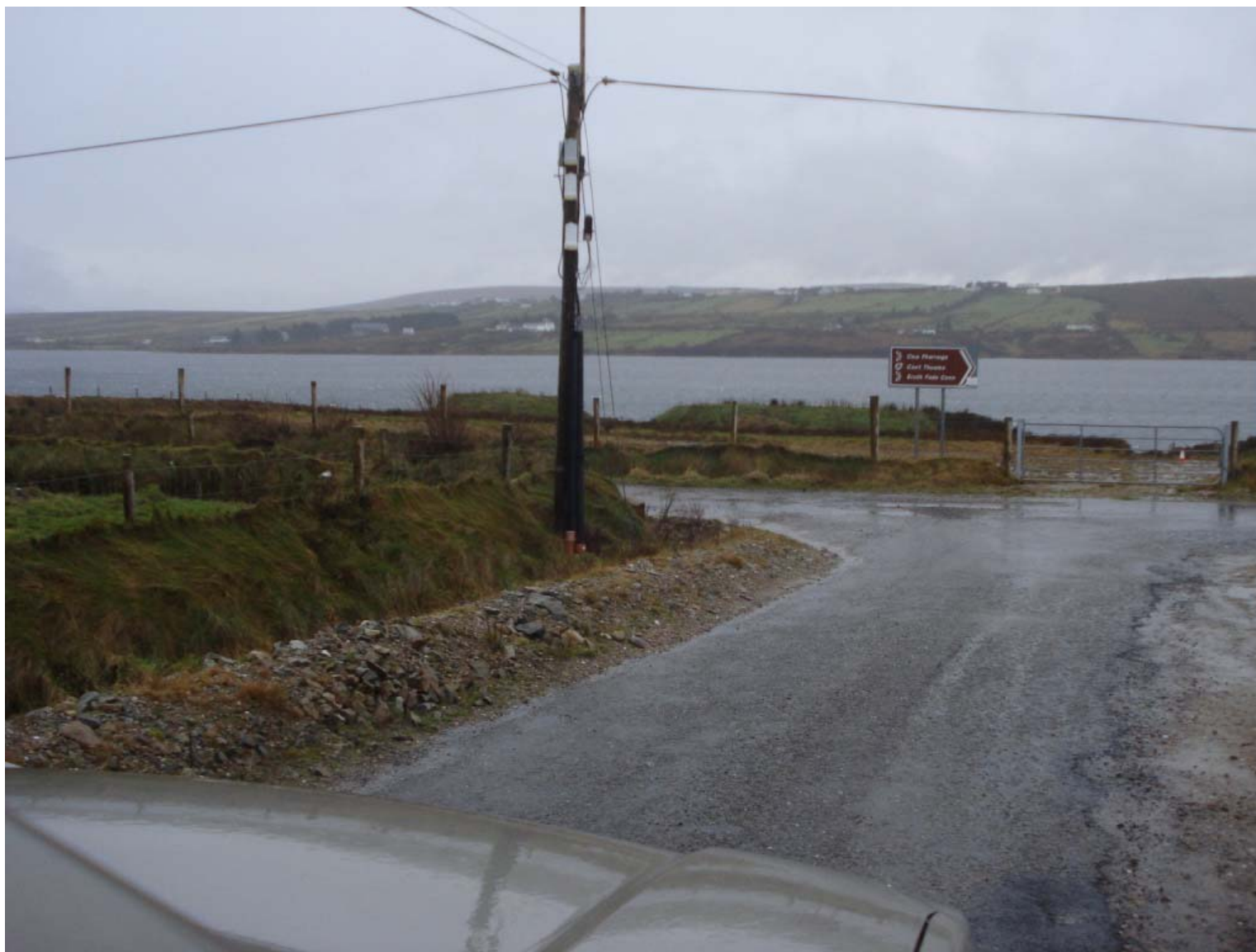
Temporary improvements at T-junction of L53453-25 and L53453-0