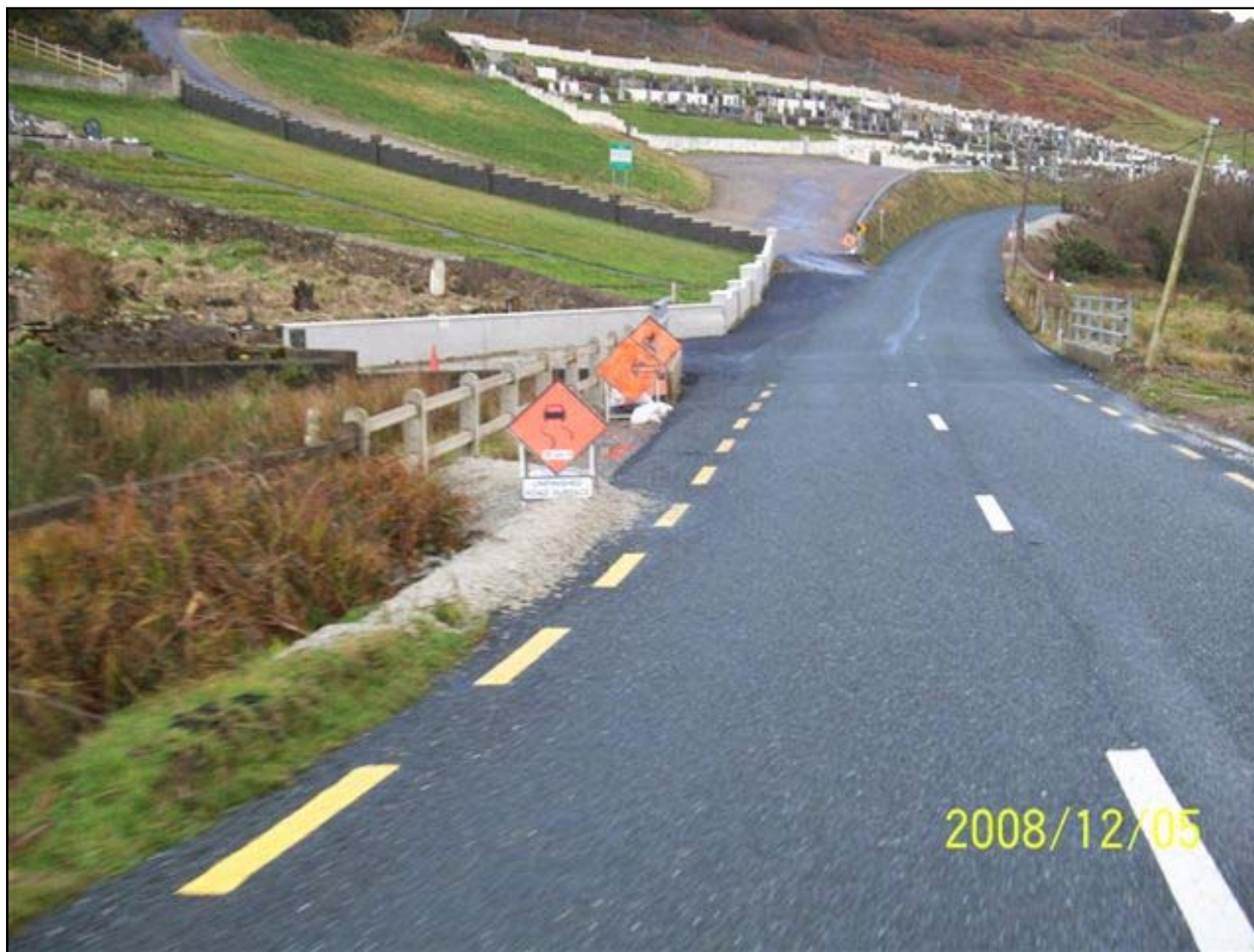
Local Road Improvements L1202 Poll a Tomais to Glengad