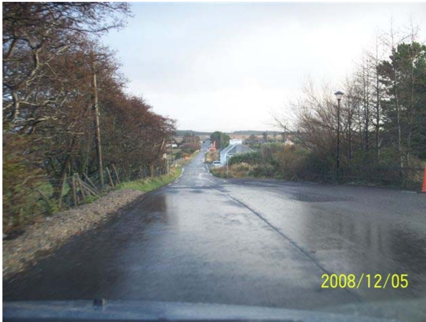
Potential Access Routes during Construction L1202 Poll a Tomais Road to Glengad