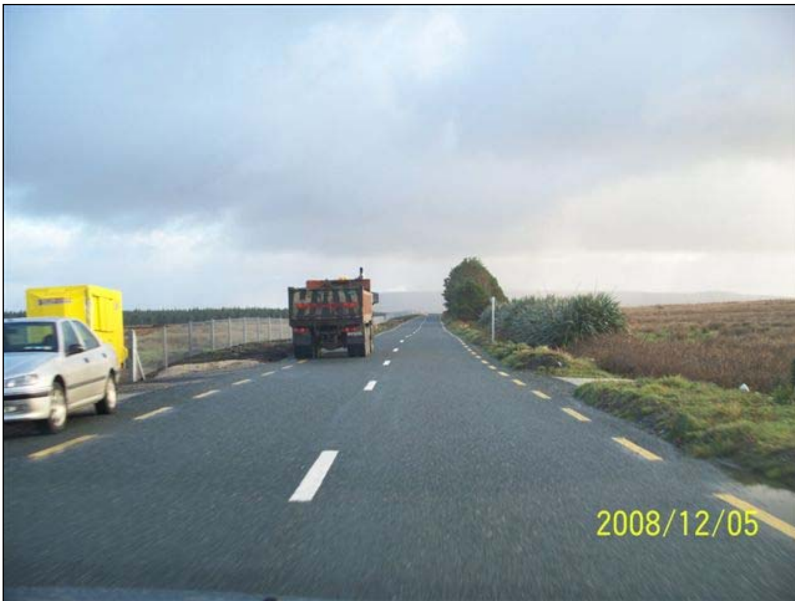
Local Road L1202 Poll a Tomais Road